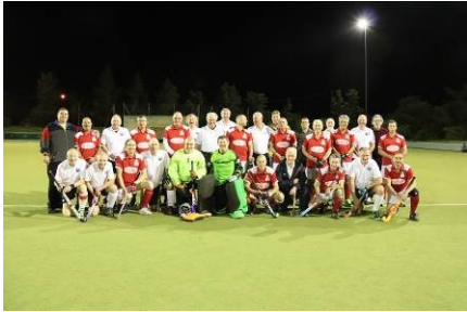
ABs and HAM