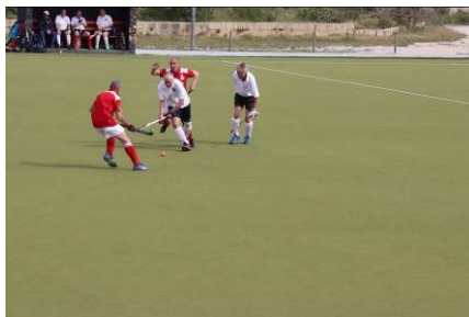
Just watch and learn