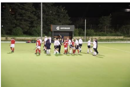
Always friends after game