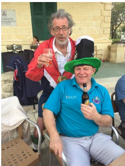
One More Beer please