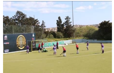
Great save Pres