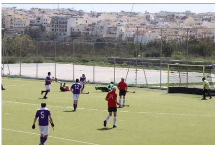
Get up you two