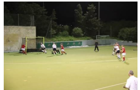
Oh dear, another goal