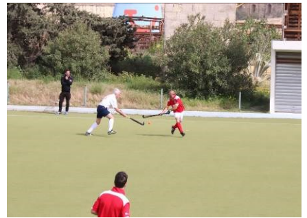
Yet another bully off