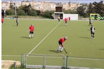
I'm over the halfway line