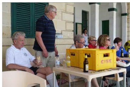
Time for a beer or two