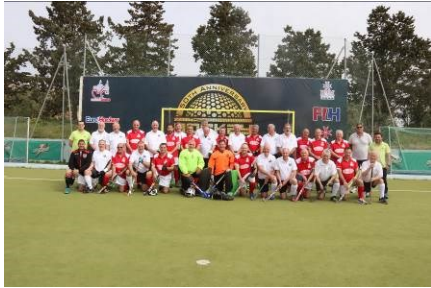
ABs and HAM