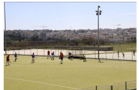
Pass to JP, who scores