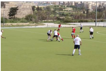
Double pronged defence