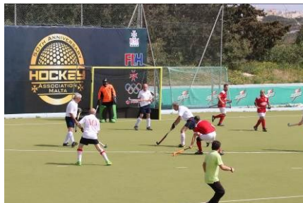
El Presidente in control?