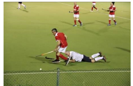
He pushed me