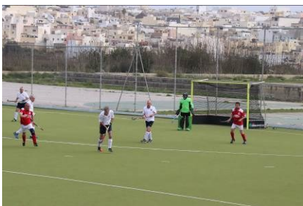
This is how you do it