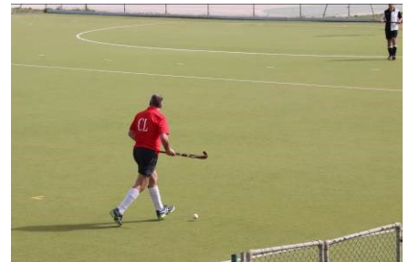
Where are you all !