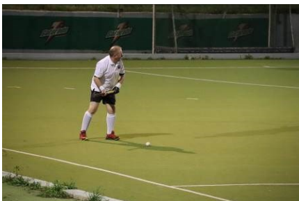
Where is everybody?