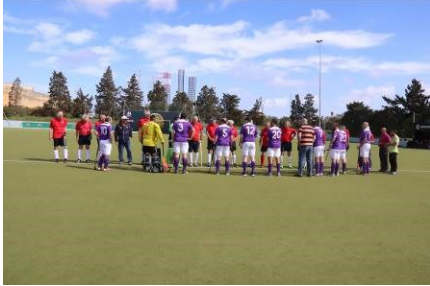
ABs and RABAT