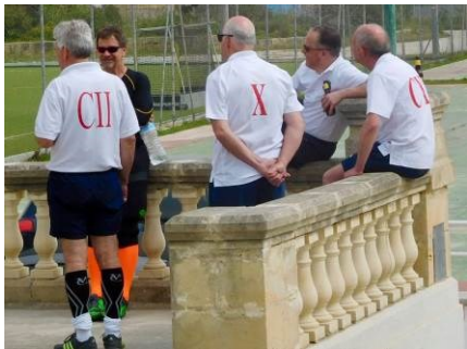
ABs prepare for battle