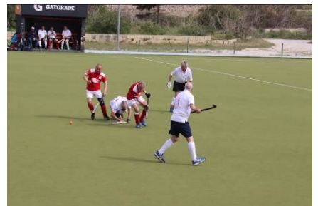
He tripped me Umpire