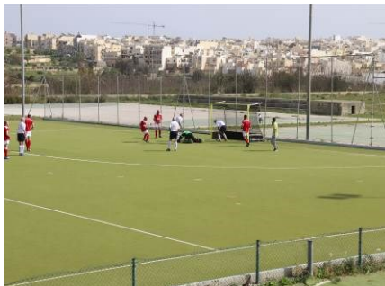
Damn, missed it - Goal