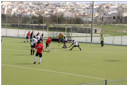
An AB shot at goal