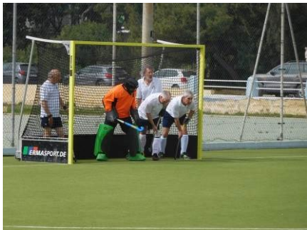
We are ready