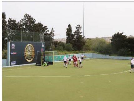
Don't worry, I've got it