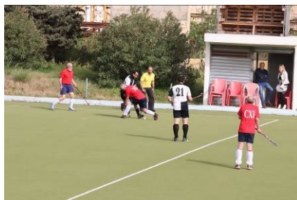
American Football block