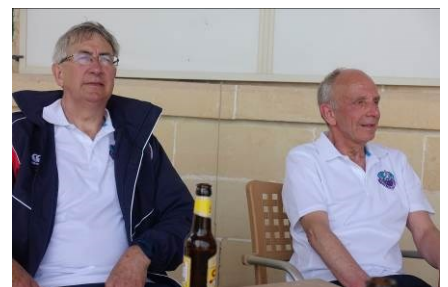
Skipper & Top Goalscorer