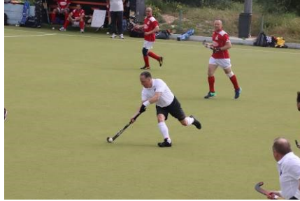
C'mon, catch me