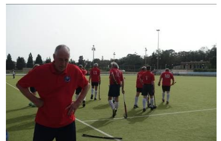
I am truly knackered