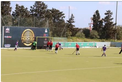
Oh No, they score