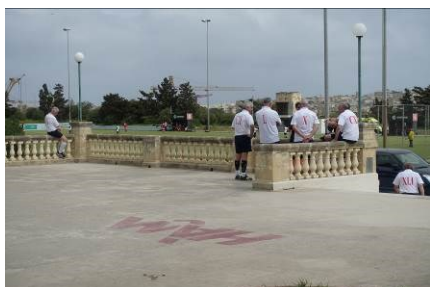
Wrong deodorant JP