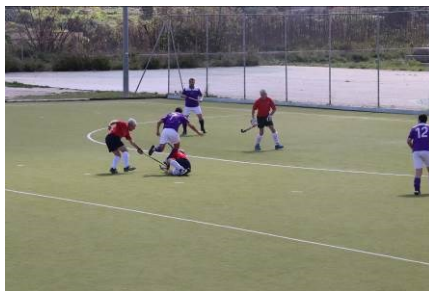
Didn't touch him, Umpire