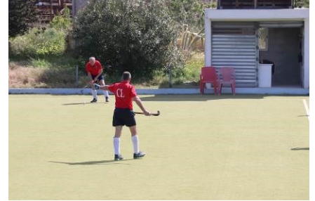
Which way are we going