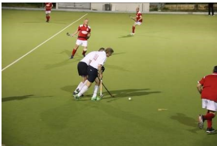
Mine, no Mine !!