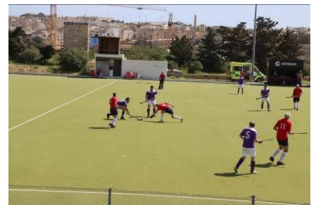
Who remembers the bully