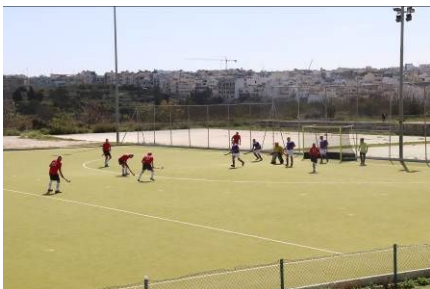
Short corner to Phil