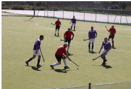
Get off, it's mine