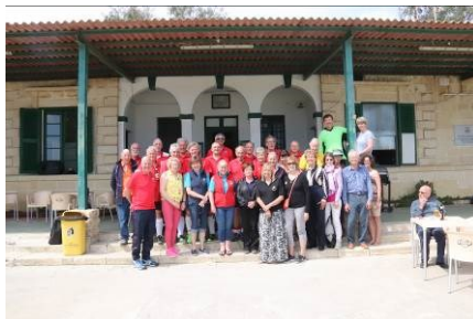
ABs and the WAGS