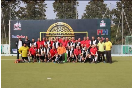
ABs and RABAT