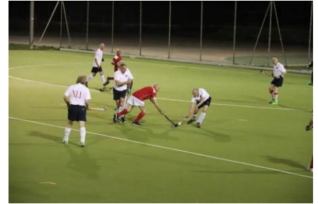
Skipper in action