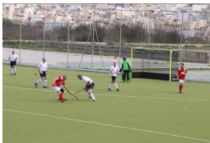
Reverse stick, bye bye